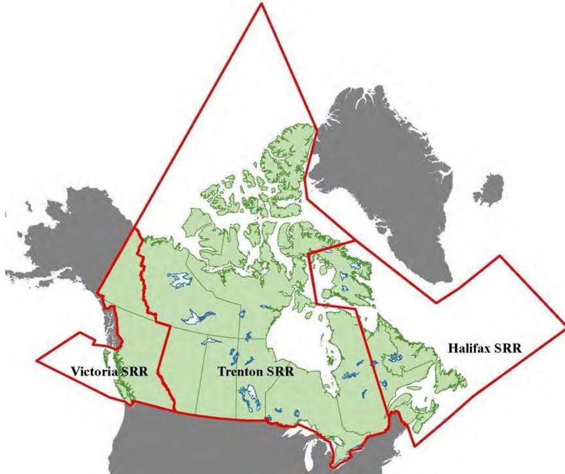
FIGURE A.1 – SEARCH AND RESCUE REGIONS (SRR)